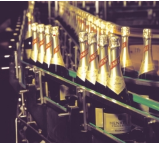
Sektkellerei Henkell & Co.

Protection is provided by comprehensive installations, consisting of one master control panel and five remote panels in the essernet® network. Multiple fire detection panels and one intrusion detection system are networked and connected to the multi-terminal WINMAG hazard management system. One WINMAG workstation is located in the porter's office and another one is located in the electrical shop, where the hazard management system is edited. On account of the vast premises, some control panels are networked with fibre-optic cables bridging greater distances than standard wiring techniques.