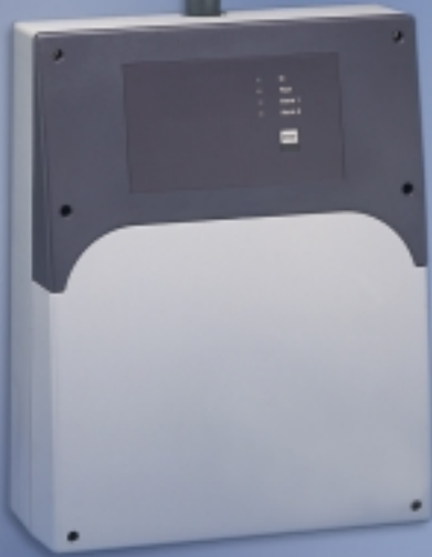
ARS 70: early detection of fires for different environmental conditions