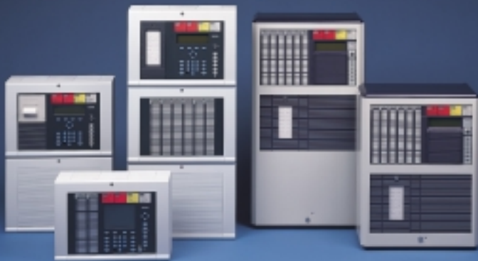
Fire detection system 8000: unlimited scope of system solutions

All information from both systems is transmitted to the WINMAG workstation in the porter's office. It is then structured and bundled by the user-friendly hazard management system, allowing all control panels to be controlled via a standard user interface. Even if the system is expanded by additional security systems, this function will remain.