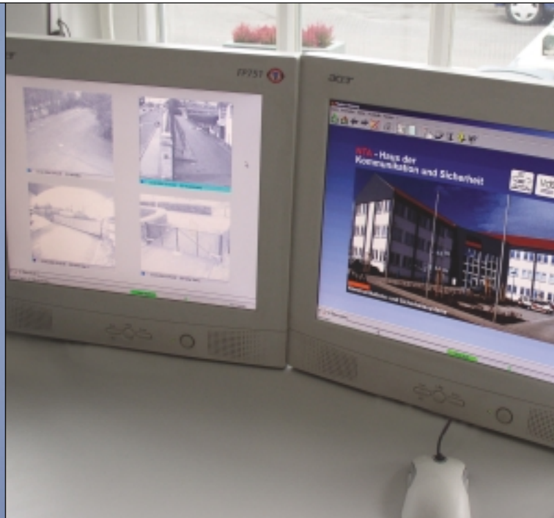
WINMAG: easy and structured control from one central workstation